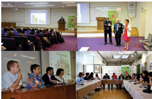
Speakers and Participants of the Symposium

The event was organized and sponsored by the AUA School of Public Health, the Columbia University College of Physicians and Surgeons, the Fund for Armenian Relief (FAR), and the World Vision Armenia. The co-sponsors of the event including the Jinishian Memorial Foundation, the Armenian Medical Fund, the American Armenian Health Professionals Organization and the JHM Charitable Foundation. The event held five sessions which covered childhood malnutrition, current assessments in childhood nutrition in Armenia, current nutrition interventions in Armenia, nutrition and non-communicable diseases, nutrition education, training, and capacity, and clinical issues in nutrition.