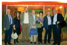
Historic MPH Leadership

The workshop brought together experts from the Blacksmith Institute, the EU, the FAO, representatives from the Ministries of Health, Emergency Situations, Nature Protection and Agriculture, NGOs, and investigators from the AUA School of Public Health.